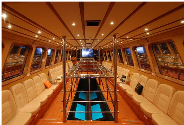
Salon / Glassbottom